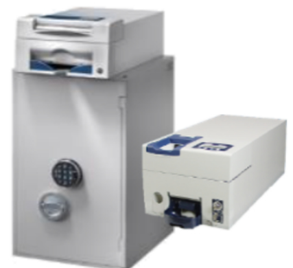
CINEO 6010 Standard Cassette and iCash 15e is your ideal front-office system. Convenient, accurate and secure.