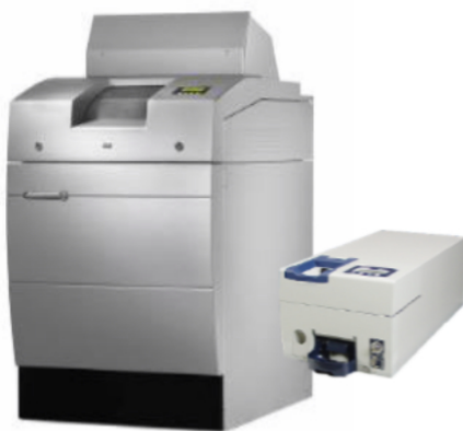
CINEO 6020 Standard Cassette and iCash 15e is your ideal back-office system. Convenient, accurate and secure.